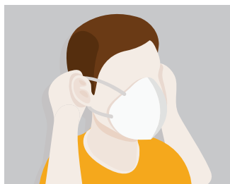
2. Cover your nose, mouth and chin.