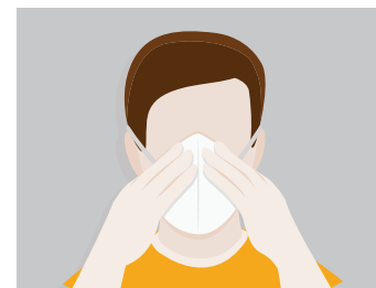
3. Form the mask over and around your nose.