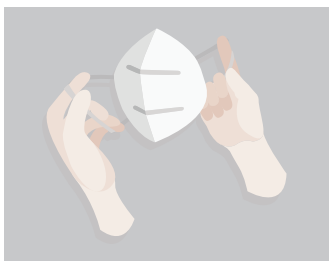
1. Hold the mask by the loops.